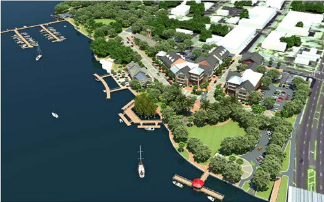
Aerial View from Southwest Palatka Riverfront Park

RIVERFRONT PARK PUBLIC IMPROVEMENTS. The public part of the Plan consists of the following key design elements, most of which have been completed or are underway: